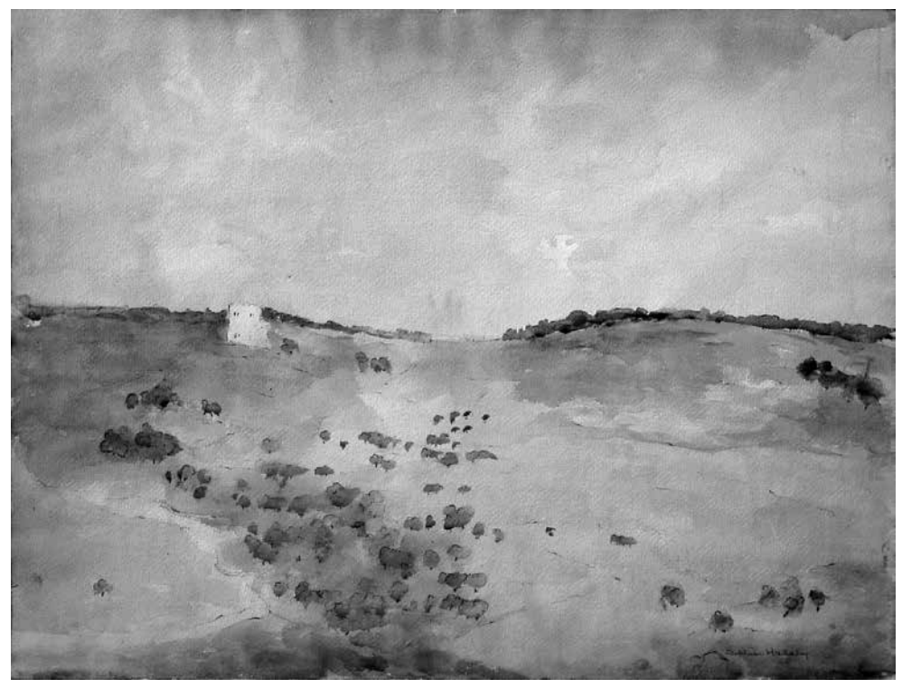
Plate 4: Sophie Halaby, untitled landscape, possibly of Mount Scopus, undated. Watercolor on paper, 64 x 48 cm. The art collection of Yvette and Mazen Qupty.