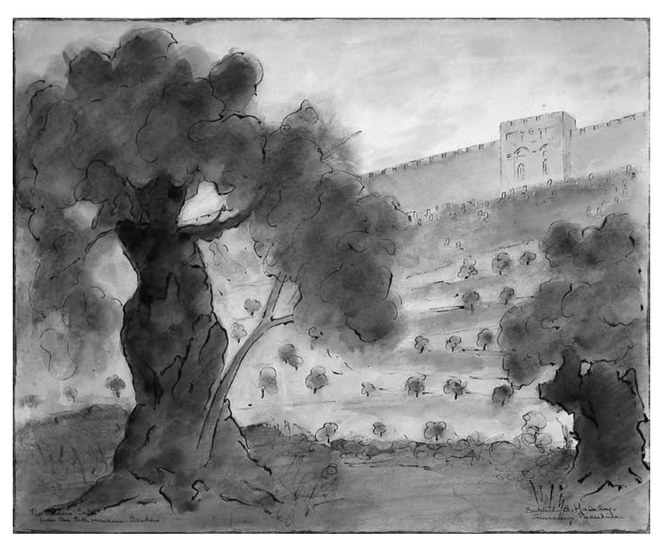
Plate 5: Sophie Halaby, "The Garden Gate, from the Gethsemanie Garden," undated. Watercolor on paper, 55 \times 46 cm. The art collection of Yvette and Mazen Qupty.