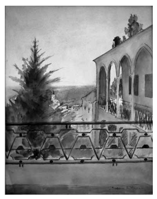
Plate 7: Sophie Halaby, untitled view of the Mediterranean from a hotel window in Europe, circa 1949. Watercolor, probably 70 x 50 cm. Location unknown.