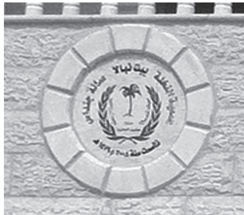
Figure 4. Jindas hall and the inauguration plaque, summer 2011.