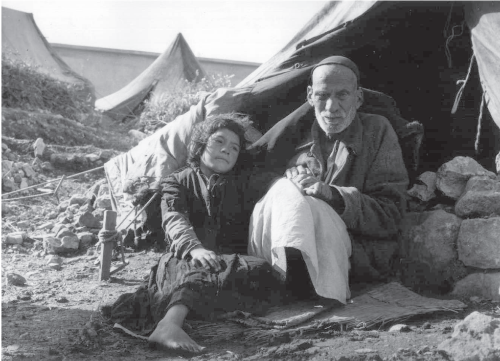
Figure 2. Early al-Jalazun refugee camp (mid-1950s). Jalazone 3

places for temporary humanitarian relief programs, Palestinian camps have become busy places full of production and reproduction. And rather than being places of expendable bare lives ( zoë ), the camps emerge as highly politicized structures, with populations with inalienable co-constituted individual and collective biographies ( bios ).