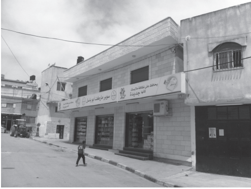
Figure 3. Abu Basil al-Nabali supermarket, summer 2011. © 2012 Khaldun Bshara.