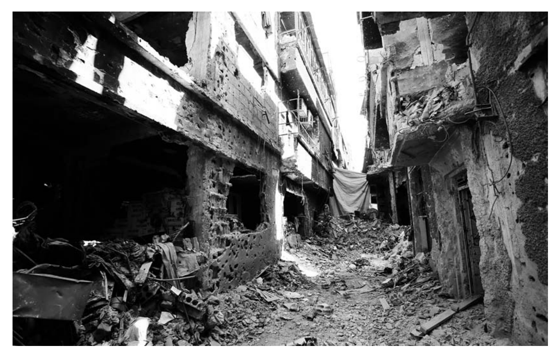
Behind a sheet, PFLP-GC fighters seeking relief in a Yarmuk camp alleyway after fighting with anti-regime forces, 12 September 2013.

The Jibril forces, from the time they were thrown out of the camp at the end of 2012, had been manning the checkpoint at the camp's northern entrance, controlling all traffic in and out. None of the international organizations such as the ICRC or UNRWA, nor any other group, could send in any kind of relief or aid. Sometimes the General Command also closed the checkpoint to people, allowing no one to enter or leave, but this was erratic. For the first six months, food was smuggled in from the rural areas to the south, but it was expensive. Some medicines and aid were also smuggled in.