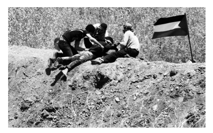
Demonstrators carry wounded fellow protestor hit by Israeli fire on 5 June 2011.

Despite what SARC's director had assured me, two field hospitals, filled almost to capacity, had been set up early that morning on the Heights and the medical teams were fully occupied. Like the International Committee of the Red Cross (ICRC) and other humanitarian organizations, SARC does not allow its volunteers and personnel to expose themselves to danger in the line of duty, so the wounded were being brought up the steep